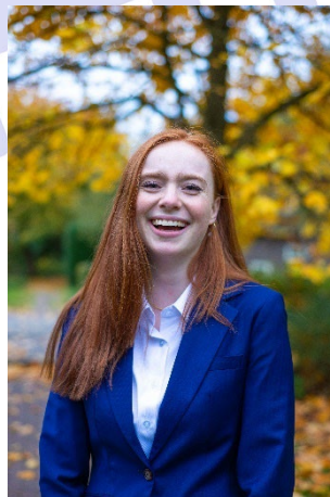
Commissioner National Affairs Wieb Devilee